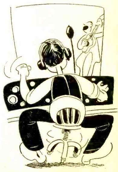
"Will I miss him, huh? Gimme a gun and I'll try not to."