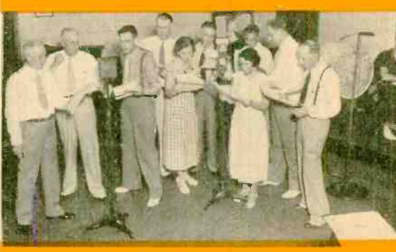
History lives again.