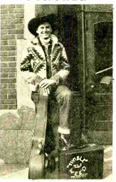
STORE CLOTHES may be all right but Tumble Weed still sticks to his easygoing cow puncher outfit.