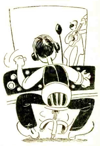
"It certainly would be a lonely prairie if they carried him back there."