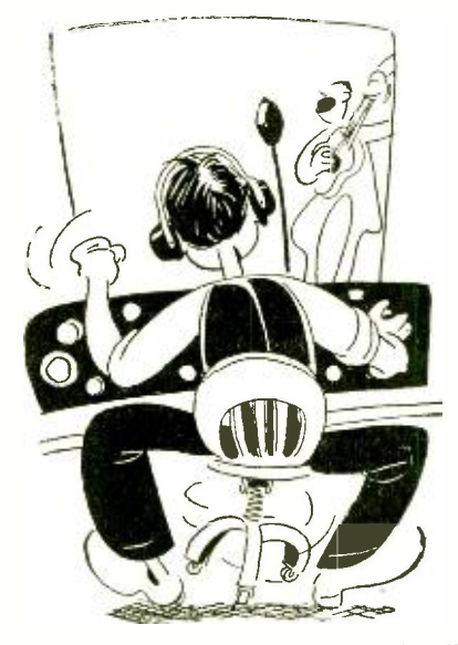
"It has been said, 'To suffer in silence is the hardest test'."