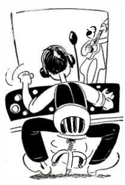
"Only one thing to be thankful for . . . he's not a twin."