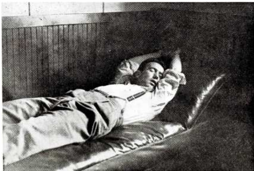
TIRED OUT from some strenuous programs, Ramblin' Red Foley catches 40 or maybe 50 winks not far from the studio.