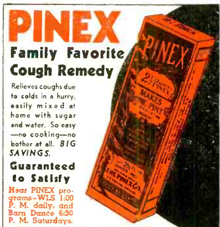
PINEX_for Remarkably Quick Relief from Coughs Due to Colds.