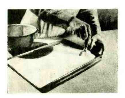
A rubber scraper helps get all the batter into the pan smoothly.

We usually think of a jelly roll as being made of a sponge cake batter. But when eggs are high priced, a mock sponge cake may be successfully substituted with economy.