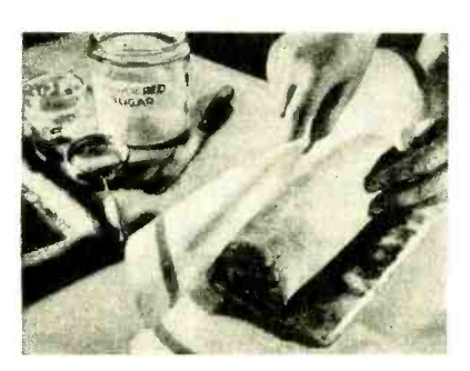
The cake is rolled while still warm to prevent cracking.

Spread the entire top of the cake generously with a tender tart red jelly. The jelly will be more quickly handled if you have beaten it previously with a fork. And by the way, this is a good way to use your soft jellies if you have some which failed to jell. And now you are ready to roll the cake. Turn up the edge of the cake about an inch, lifting it by means of the cloth or paper underneath. As you raise the cloth with the left hand, you can guide the rolling and keep the cake straight with the right hand. Continue rolling until the entire sheet is rolled and the edge of the cake is underneath. Then wrap the cloth or paper around it to hold the roll in place and cool on a cake rack.