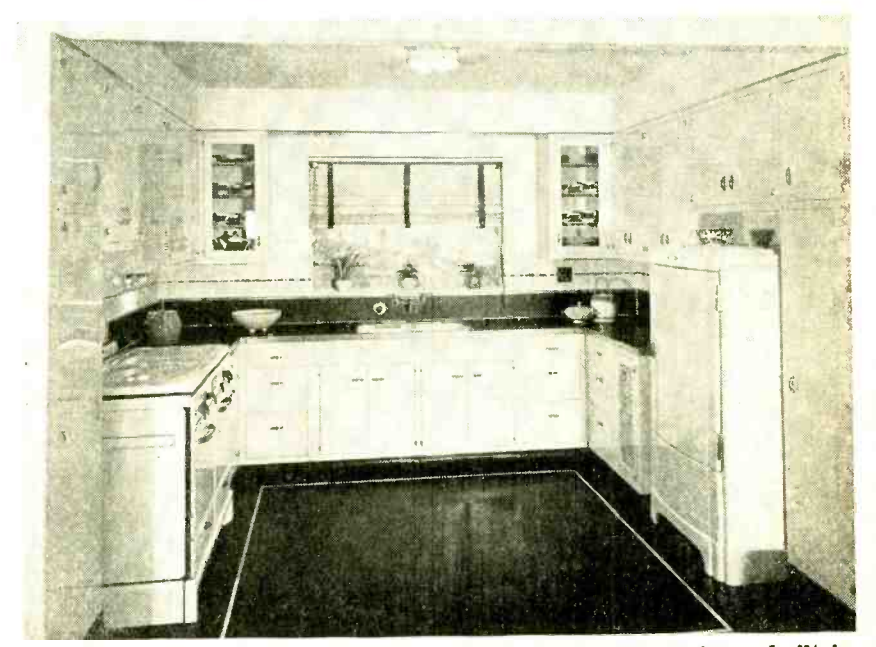
This modern, U-shaped kitchen with its level work surfaces, built-in cupboards and convenient arrangement would please any homemaker.

Wouldn't it be a joy to work in such a kitchen? If you can't have it