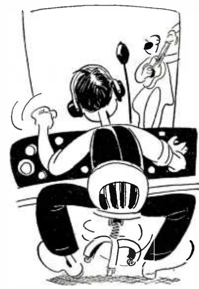
Well, anyway, this is better than driving a truck in winter weather.