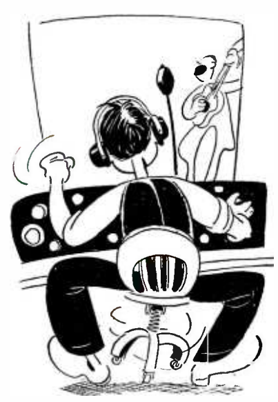
I know how I'll get rid of him. I'll report him to Uncle Sam for hoarding gold in his teeth.