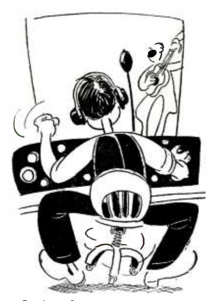
Last week our sound effects man got five new ideas for unusual and weird noises from his singing.