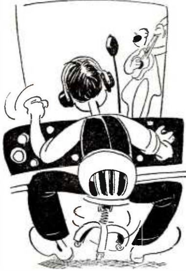
When he sang at a local theater the other night he had the audience in the aisles . . . on their way home!