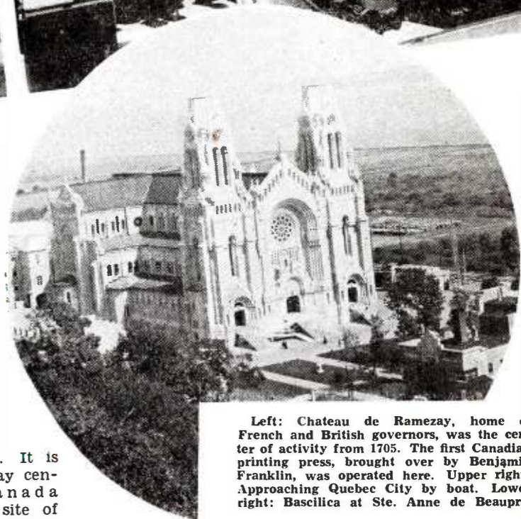
Left: Chateau de Ramezay, home of French and British governors, was the center of activity from 1705. The first Canadian printing press, brought over by Benjamin Franklin, was operated here. Upper right: Approaching Quebec City by boat. Lower right: Basilica at Ste. Anne de Beupre.

MEMBERS of the Prairie Farmer-WLS tour party which will go up the St. Lawrence and through New England, June 18 to 27, will have an opportunity to visit the province of Quebec, Canada, a district that is richly endowed with historical lore, romance and natural beauty.