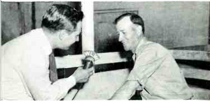
MEMBERS OF THE WLW FARM DEPARTMENT STAFF travel more than 60,000 miles a year visiting farms and attending farm meetings in Ohio, Indiana, Kentucky and parts of Michigan and West Virginia.