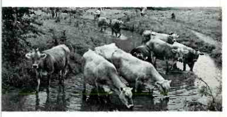
"THOSE BROWN SWISS COWS" are the major income producers. The milking herd consists of 36 Brown Swiss (and one Holstein) producing over 400,000 lbs. of milk a year.