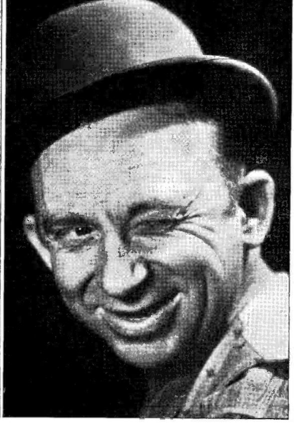
Rudy Vallee calls Rosco Ates, stuttering film comic, one of the funniest men in the world! You'll agree when you see him in person at the Omaha Food Show, October 9, 10 and 11.