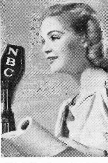
This is Nan Grey, star of Standard Brands' new WOW program, "Those We Love."