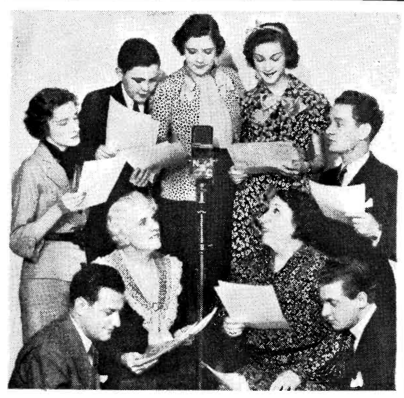
Nearly four years on the air! That's the record of "The O'Neills," the Procter & Gamble show which features the cast shown above. It is packed full of human interest, pathos and excitement.