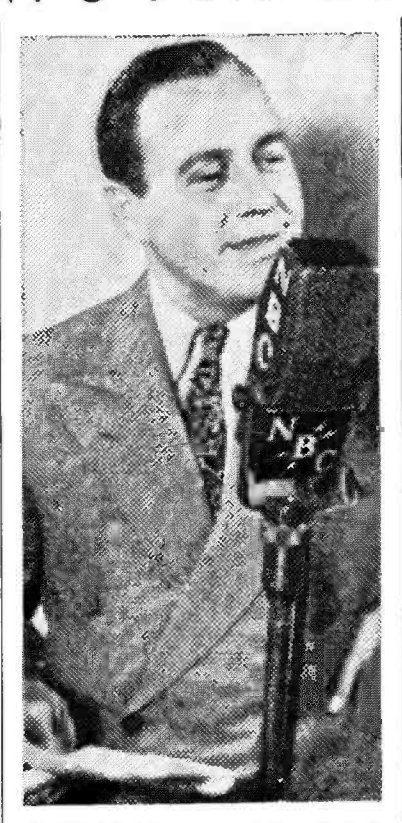
"Swell fella" . . . that's what the cast of Jack Benny's program call