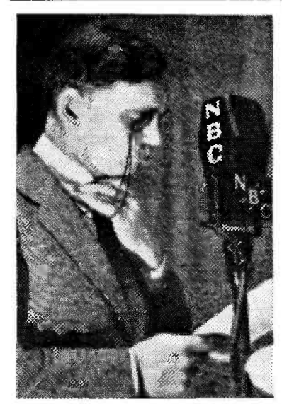
Walter Huston, America's great est living character actor and emcee for "Good News of 1940," shown at the microphone.