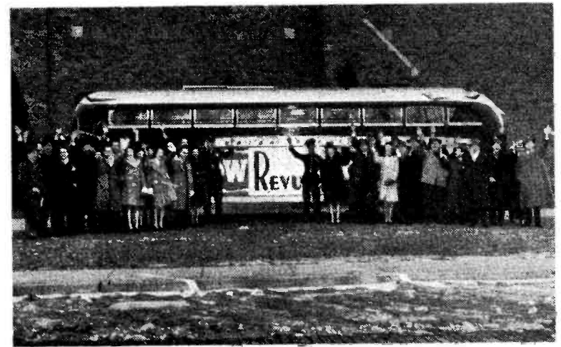
The "Red, White and Blue Patriotic Revue" cast travels in a luxurious Union Pacific Super Coach. Photo shows the entire cast alongside of its weekend "home."