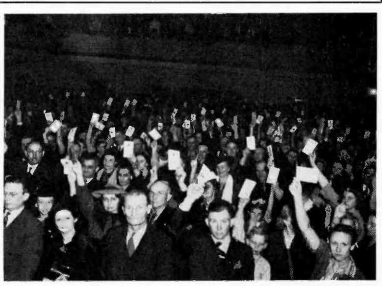
This is the packed house at the Columbus evening show proudly waving their U. S. Defense Stamp books. Every person at every performance buys 50 cents worth of Defense Stamps in a new album in order to attend the "Red, White and Blue Patriotic Revue.