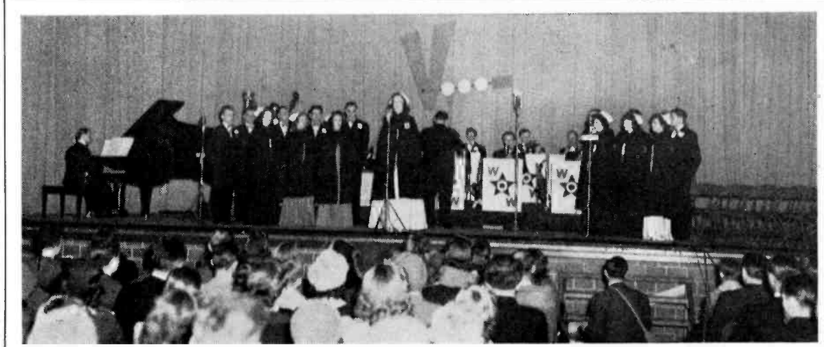
Another colorful and inspiring musical selection is