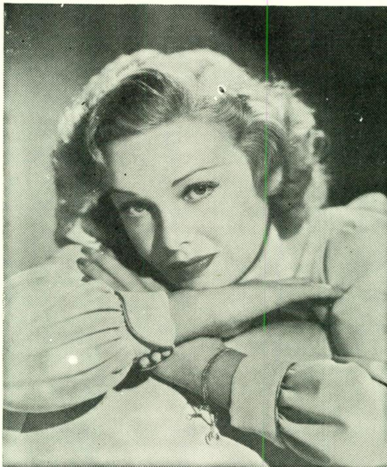
Maintaining its policy of featuring big-name stars straight through the summer months, "Cavalcade of America" has signed up Madeleine Carroll for two broadcasts in August—3rd and 10th, on WOW, Mondays, 7 p. m.