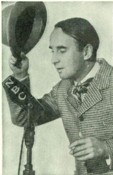
Funnyman Walter O'Keefe, credited (with Fred Allen) with starting a revival of vaudeville, has a new assignment in radio. He's now master of ceremonies on Molle's "Battle of the Sexes" show, Tuesday nights, 8 o'clock, on WOW.