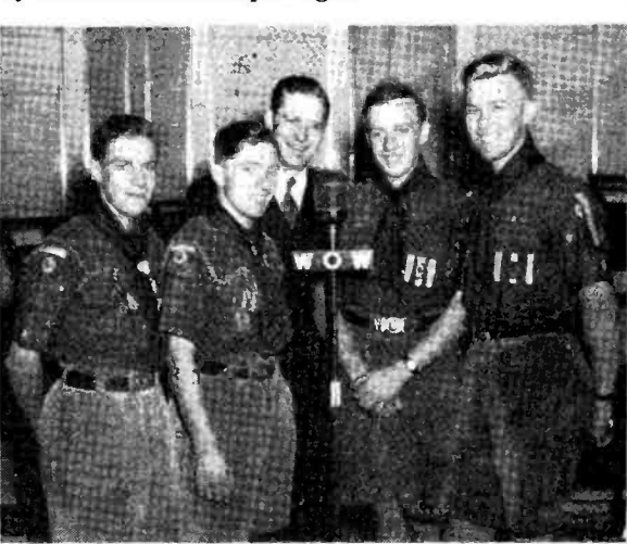
LONDON SCOUTS . . . these jovial Boy Scouts from London told "Noonday Forum" listeners what to do, and what not to do, when Axis bombs fall.