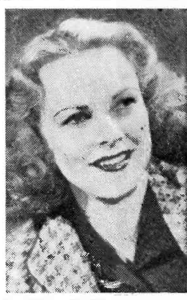
star of Woodbury's "Thin Man.