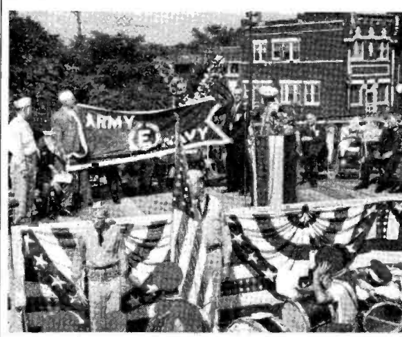
. . WOW's Special Events 'E"-DAY SPECIAL crew covered the awarding of the Army-Navy E flag at the Omaha Steel Works. Photo shows presentation