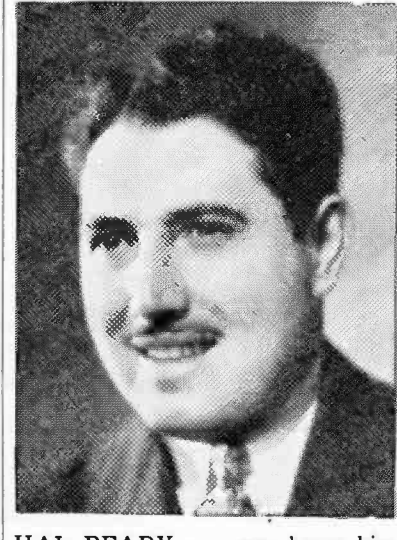
HAL PEARY . . you know him better as "The Great Gildersleeve."