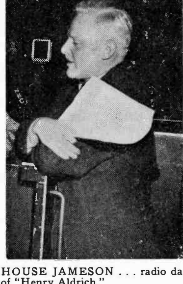
HOUSE JAMESON . . . radio dad of "Henry Aldrich."