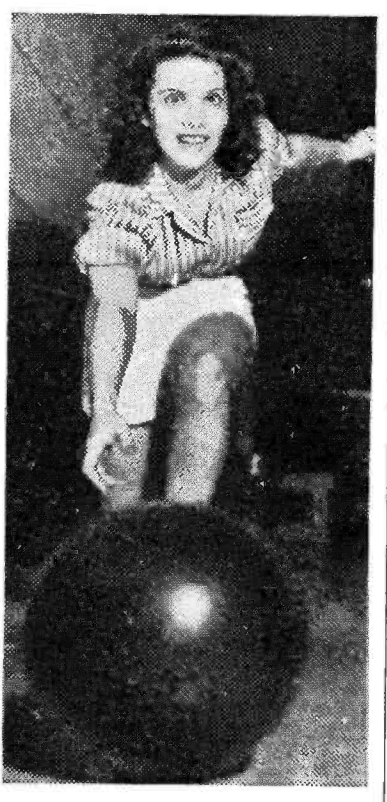
DINAH SHORE . . . songbird on Eddie Cantor's Ipana show, was voted "the year's outstanding new star" and radio's champion feminine vocalist (popular).