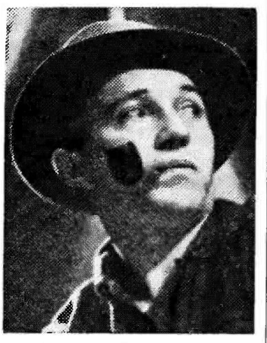
BING CROSBY G CROSBY . . . as master of "Kraft Music Hall," was considered radio's best emcee, best male vocalist (popular) and boss of radio's best variety show.