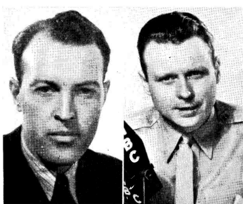
GEORGE HICKS breath-taking descriptions of actual battle made radio broadcasting history on D-Day, and on D-Day plus

Because the WOW management realized the full importance of the invasion story and for the further reason that WOW is the only station in this area which carries the Big Three press services, WOW listeners kept their ears glued to 590 and received the best invasion news service available anywhere in the world.