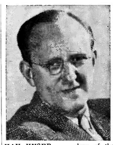
"Kollege of Musical Knowledge" zooka and a hilarious new program and champ soldier entertainer, re- entertainers, is due back September setup to pep up the Thursday sched- turns to his former Wednesday 27 with his "Time to Smile" pronight spot on October 4.