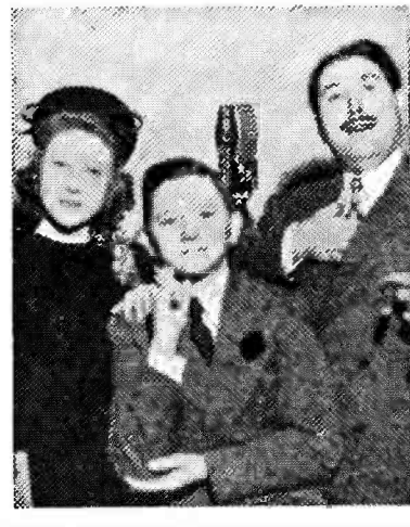
THE GREAT GILDERSLEEVE . . . shown with "Leroy" (Walter Tetley) and Niece Marjorie (Lurene Tuttle), will come back on WOW on September 3.