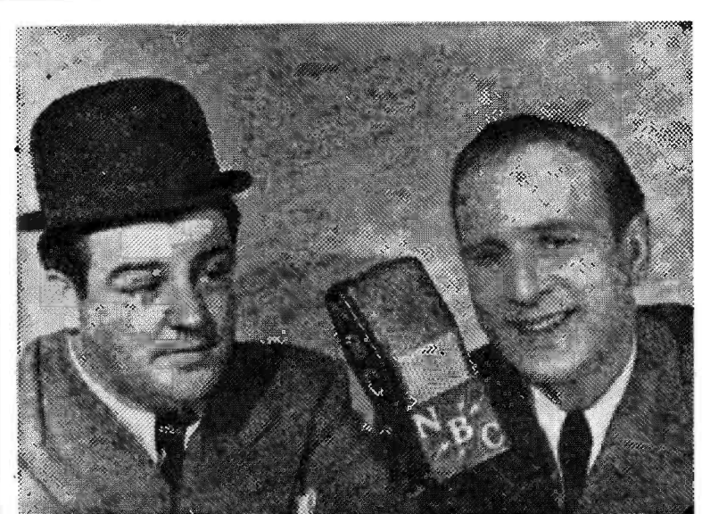
BUD ABBOTT and LOU COSTELLO are due back on October 5. There'll be laughs every second in this Thursday nighter during the fall and winter season on WOW.