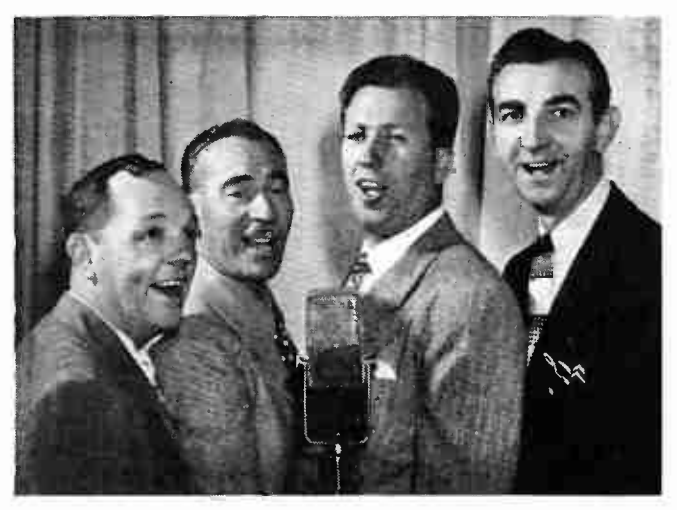
Together since 1929, the King's men offer a musical program in the Tuesday spot vacationing "Fibber McGee and Molly."