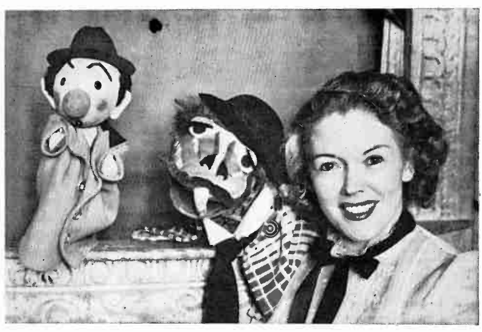
Another great NBC television show, "Kula, Fran and Oillie, is already a favorite with WOW-TV viewers. This RCA Victor show stars two cute puppets, Kula and Oillie.