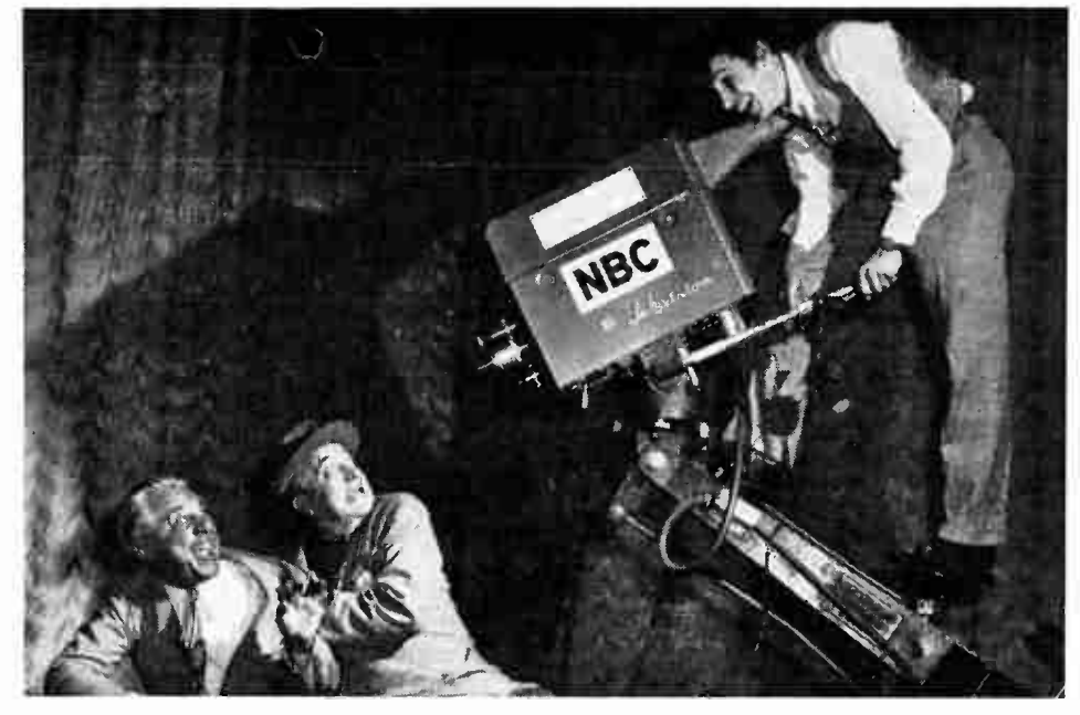
The two zaniest comics in show business. Olson and Johnson, star on the Buick TV show on NBC network (shown the other night on WOW-TV).