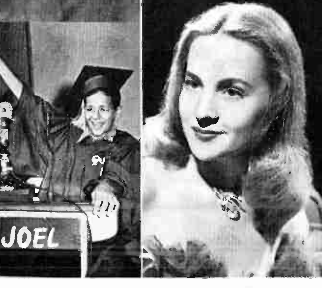
For Camels, 8:30 p.m., Fridays (October 7).