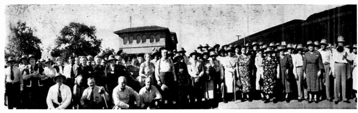
Members of the WOW Farmers' West Coast Farm Study Tour posed by its 17-car special train in Stockton, Calif. . . .