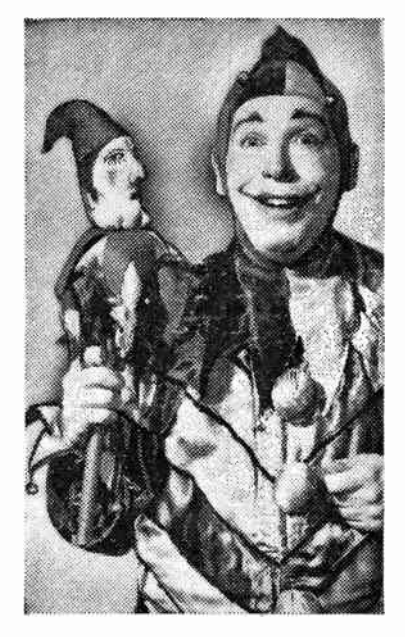
LAUGH CLOWN — Milton Berle's "Texaco Star Theater," top-rated TV show on the air is a great Tues-day night at 7 feature on WOW-TV. It offers top-notch guest stars, variety and comedy.