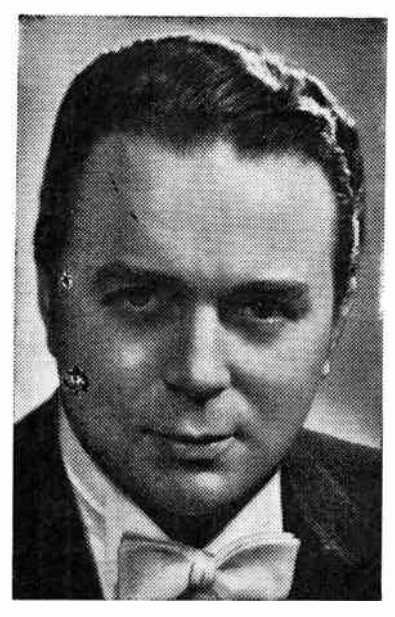
TENOR TAGLIAVINI — Noted soloist Ferruccio Tagliavini helped celebrate the 500th broadcast of NBC's "Telephone Hour" recently. This Monday night feature costs $11,500.