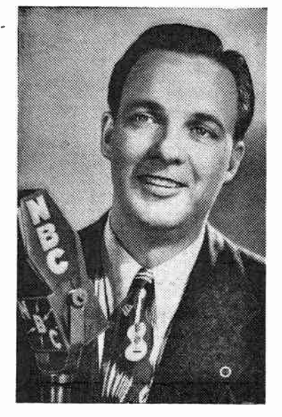
CROONER CROSBY—Bob Crosby sings and emcees his own show each Sunday night at 9 p.m. on WOW. The show for Pet Milk costs $7,000, according to Variety.