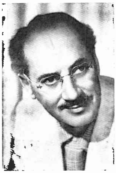
GROUCHO-One of many winners.

Nine NBC radio and television stars and programs won first place honors in Radio Daily's annual poll of outstanding radio and television