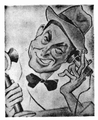
Archie says—Sure "Duffy's Tavern" is a "Tandem" Show.

Called "Operation Tandem" the plan is built around NBC's new 90 minute super-program, "The Big Show." It provides all parties concerned with a diversified programming plan that includes variety. ming plan that includes variety, comedy, drama, adventure and