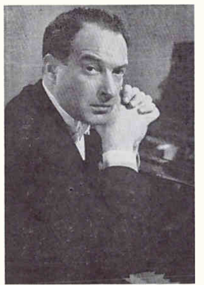
The droll but not dumb Dane, Victor Borge (pronounced "Borguh") stars in the new variety headliner at 6 p.m., Saturdays on WOW-TV (via NBC), for Kellogg cereals. It was pre-rated as one of the net's finest productions.