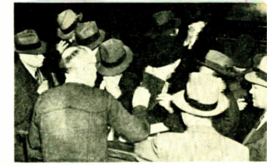
Gambling patrons turn shy before camera. More than 100 were arrested in this routine "publicity" raid by police.