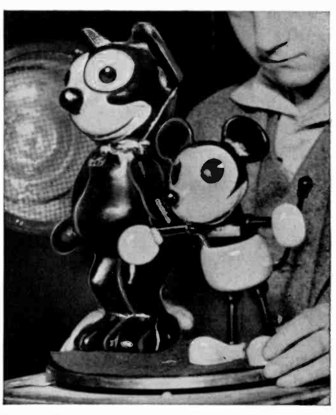
Felix the Cat and Mickey Mouse were, during television's experimental period, the most frequently televised actors on the air. Using them as "stand-ins," RCA engineers gathered basic data on instruments and techniques.