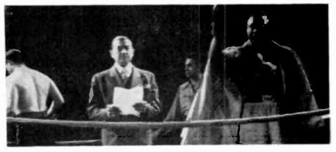
ANNOUNCER: "... the all-time favorite ..."

FLASHY: Nice looking kid. Not marked up yet. But he will if he stays in the racket-no matter how clever he is everybody'll be able to tell he's a fighter—just like his wife was able to spot me in the restaurant.