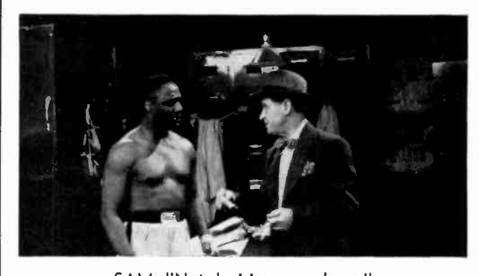
SAM: "Not decision . . . a kayo."

SAM: (Shaking his head): Uh-uh. Not decision—a kayo.