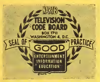
NARTB-TV CODE SEAL

Telecasting Notes: By far the majority of TV stations on the air (95 out of 133), plus all 4 networks, now subscribe to the NARTB Code, entitling them to flash on their screens the NARTB Seal of Good Program Practice. As of