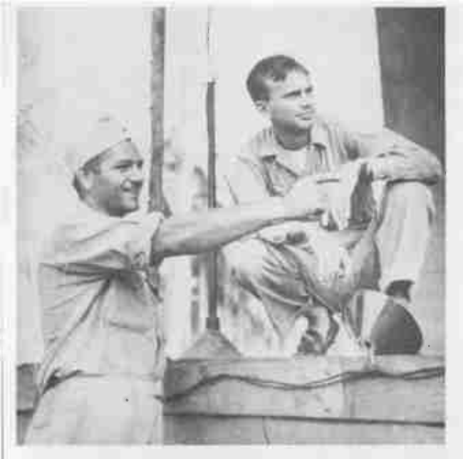
On Guadalcanal with the 1st Marine Division.