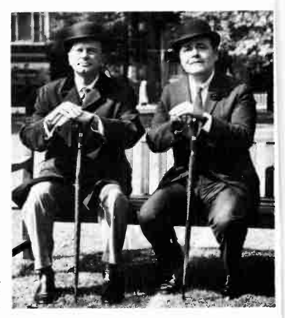
RIGHT, in London. BELOW, Richard Burton in a rare comic moment.