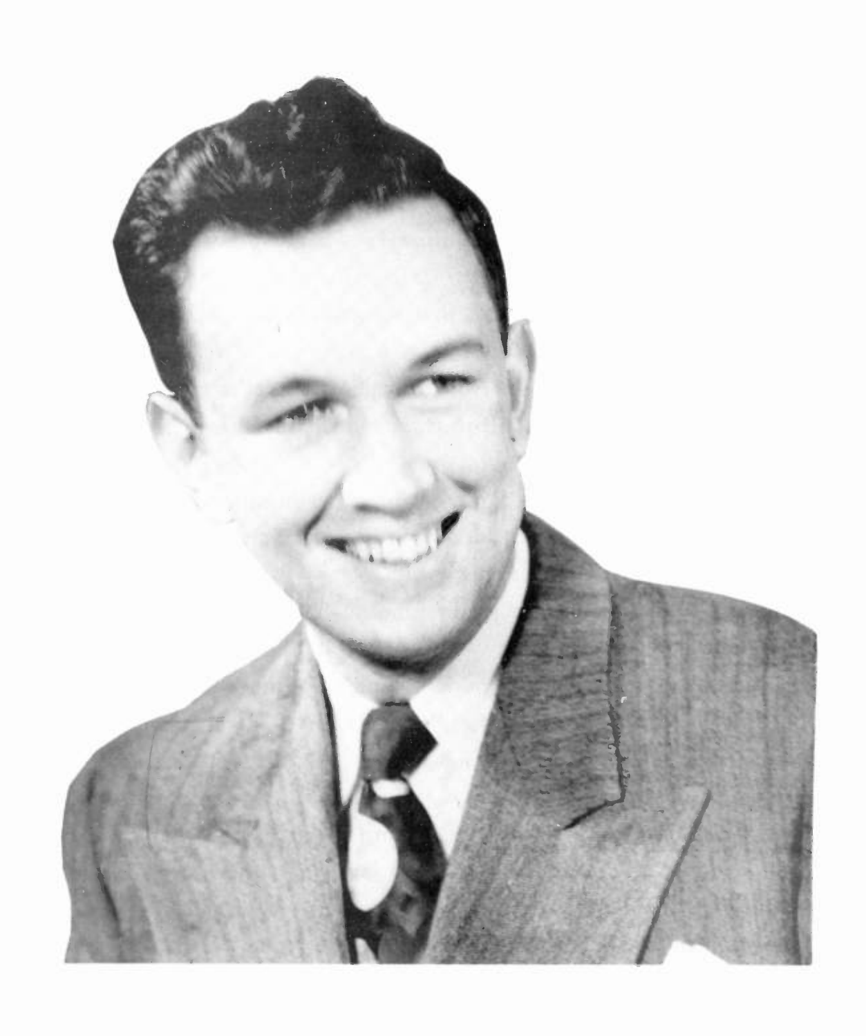
1950 and 1951 in Douglas Georgia Announcer with hair and teeth