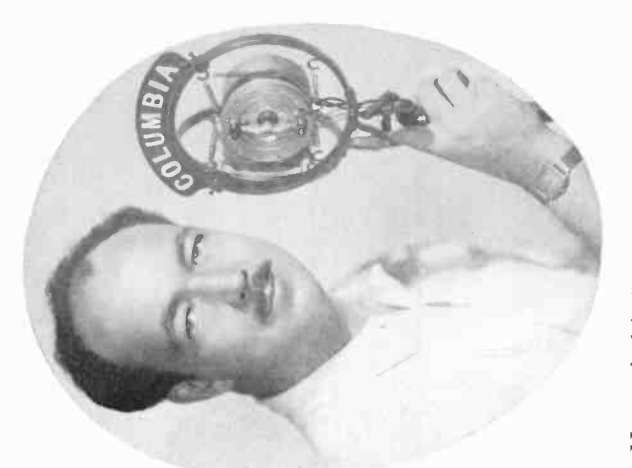
He made his first important come-back in radio when he left WCAU in Philadelphia to become Chief Announcer of CBS.