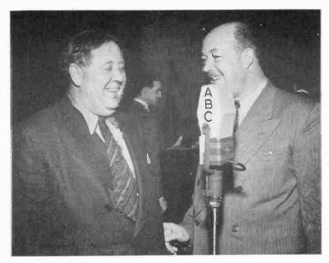
A happy moment backstage with Charles Laughton as the sound-effects man checks the volume of his laughter.