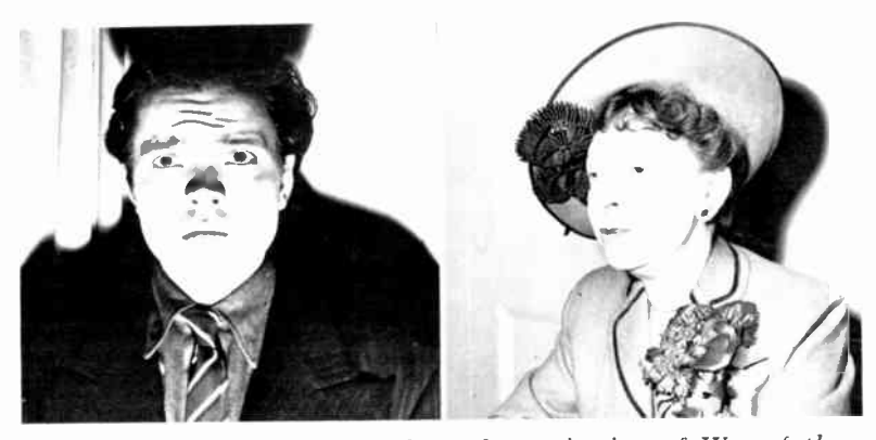
Left: The creative talent whose dramatization of War of the Worlds plunged the nation into an evening of panic in October, 1938, belonged to Orson Welles. Even before that broadcast Welles had been a successful radio personality, appearing in dramatic roles including that of Lamont Cranston, hero of The Shadow. (Source: Wide World Photo) Right: A successful writer of radio soap operas for three decades. Irna Phillips had little difficulty making the transition to television serials in the 1950s. (Source: Wide World Photo)