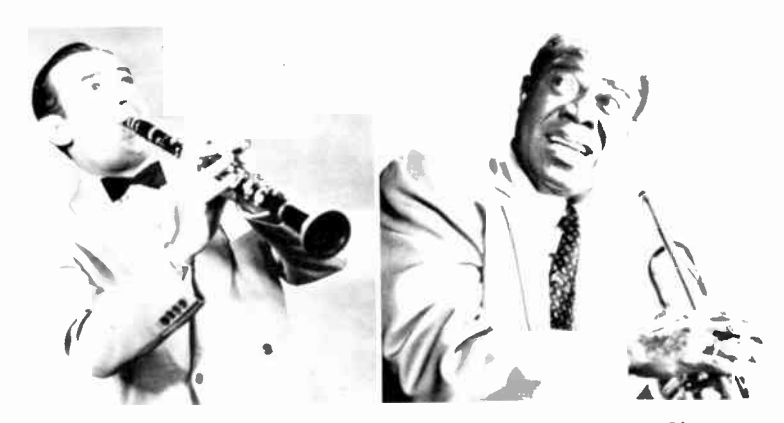
Left: One of the more popular "swing" band leaders was Jimmy Dorsey. Remote hookups brought home listeners the pulsating music of the jitterbug live from dance halls, night clubs, and hotels throughout the country. Right: Louis Armstrong appeared on many musical programs, but his own show in 1937 was short-lived.