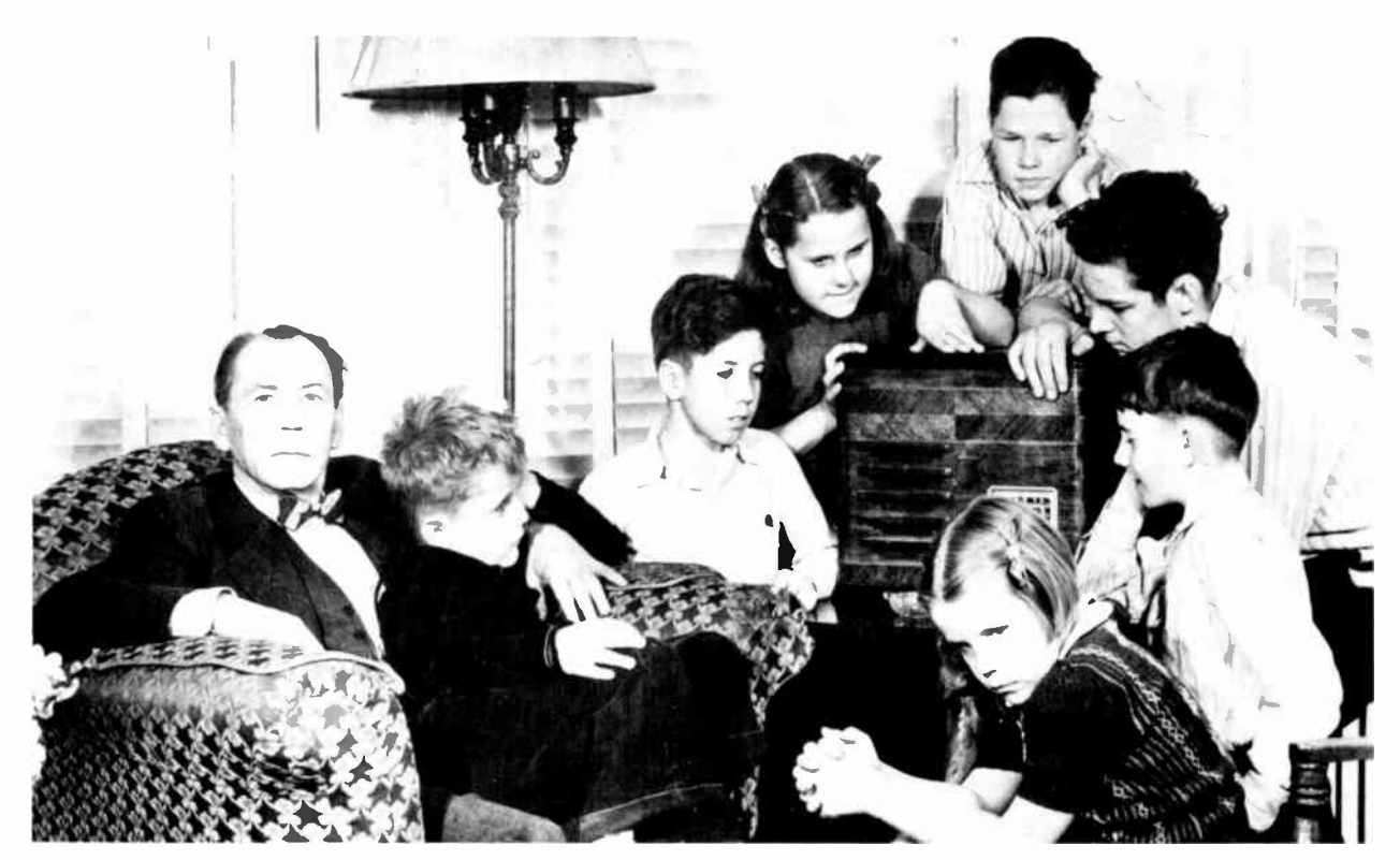
By the late 1920s radio had become a most popular living room utility.