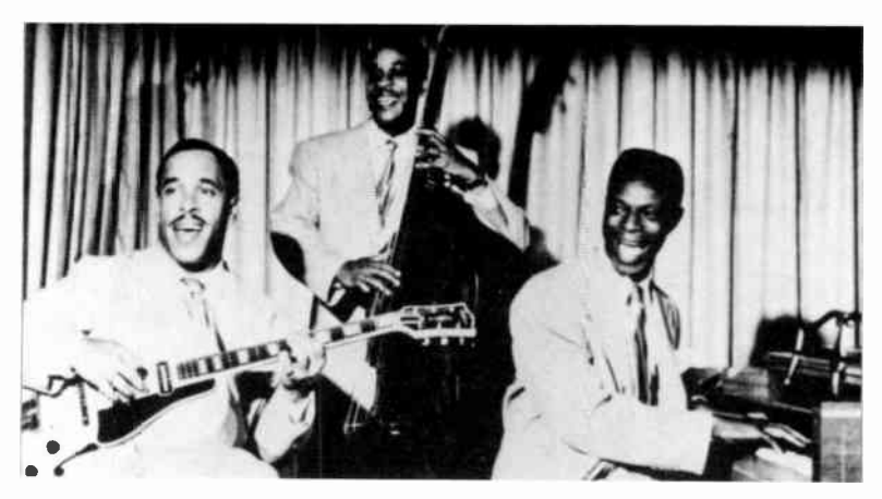
The King Cole Trio, led by singer-pianist Nat "King" Cole, came to network radio in the mid-1940s.