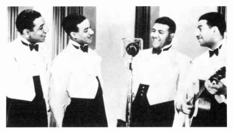
The Mills Brothers gained national recognition over the air in the early 1930s. Four decades later they are still popular favorites.