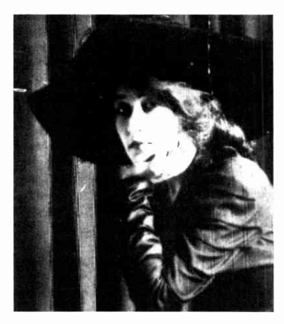
The Georgia Peach