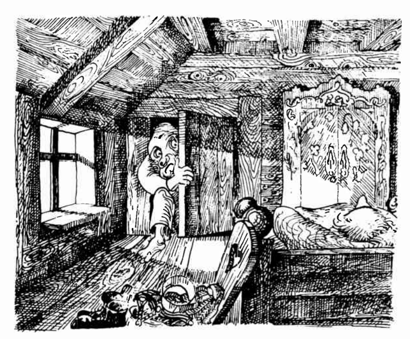
Examples of Mr. O.K.'s pen drawings