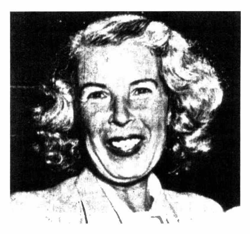
Mildred (Axis Sally) Gillars