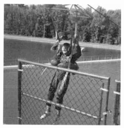
Dangling periously above the water as I learn to parachute.

Mission Control called me to inquire about the whereabouts of two of my astronauts who were on board the craft. I turned around and looked back at the open payload bay behind me.