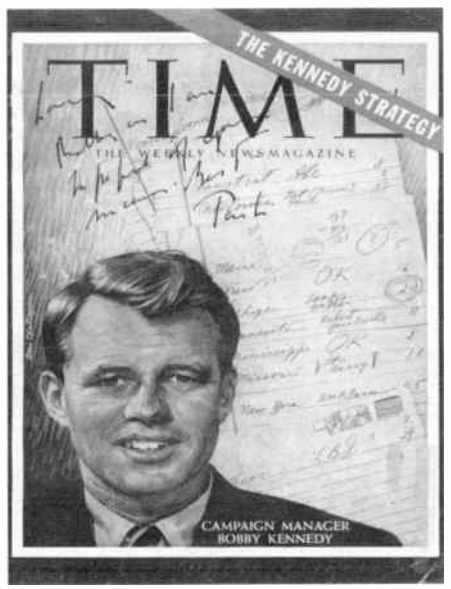
TIME magazine, October 10, 1960.

I left the note card and the magazine in Cloud's possession for storage in a vault. I could just imagine myself in my car, driving down the road with my new purchase, rolling down the window, and watching as the note card and magazine flew out the window onto a busy Atlanta highway, with an eighteenwheeler putting its own personal stamp of approval on them.