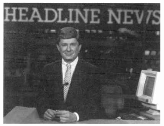
Anchoring from the old Headline News set at 1050 Techwood Drive in Atlanta. Yes, I wore a hairpiece for a few months in 1986 until my hair grew back.