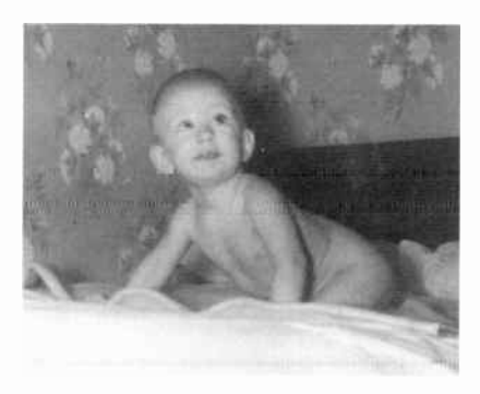
An embarassing baby photo.