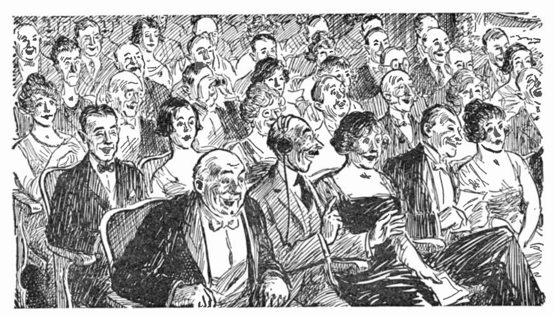
Reproduced by courtesy of Judge-March, 1924.