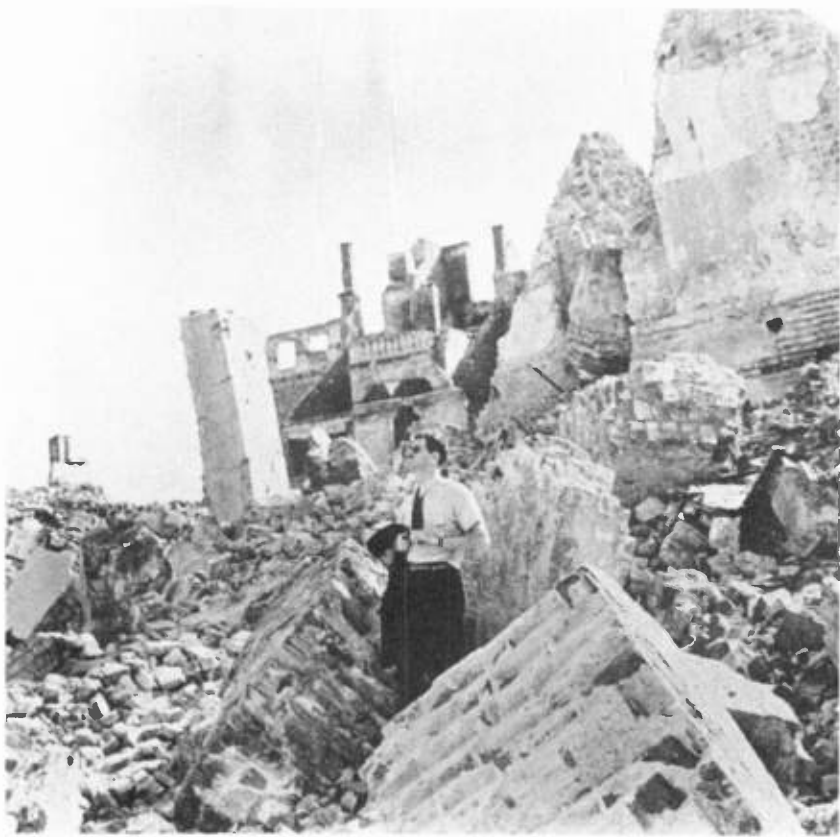
ONE WORLD FLIGHT. Corwin stands amid the rubble of the famed Warsaw Ghetto, one of the many sites of mixed disillusionment and hope witnessed on his postwar tour of the world.