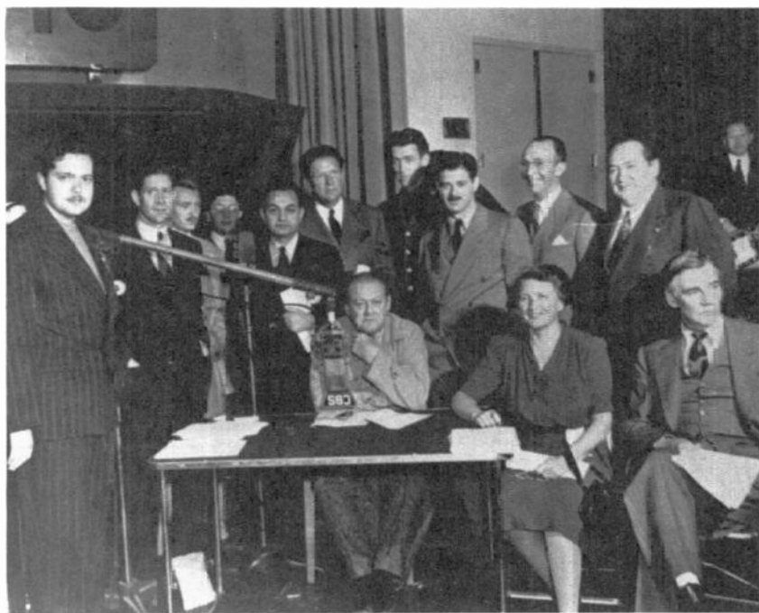
WE HOLD THESE TRUTHS. The cast, including such Hollywood luminaries as (left to right) Orson Welles, Rudy Vallee, Edward G. Robinson, Bob Burns, Jimmy Stewart, Walter Brennan, Edward Arnold, (seated, left to right) Lionel Barrymore, Marjorie Main, and Walter Huston, posed with Norman Corwin (center).