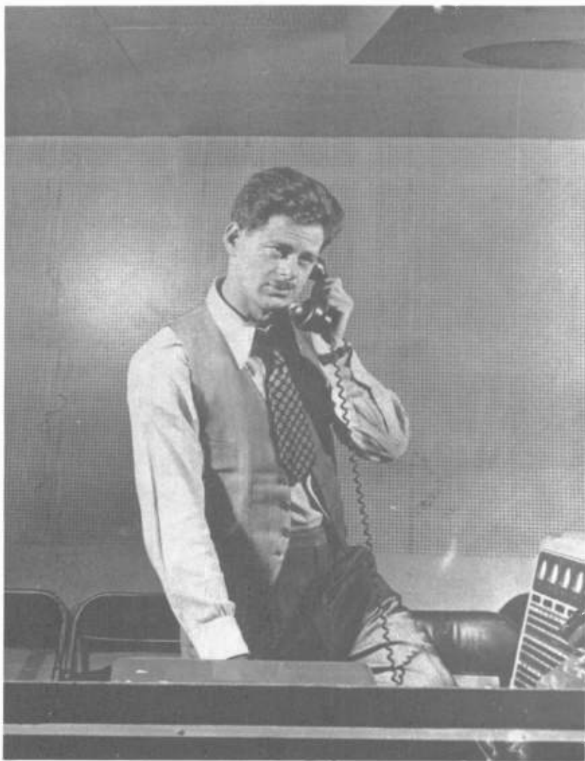
THE CONTROL ROOM TELEPHONE. "Few barometers of success are more dependable." Corwin fields a congratulatory call.