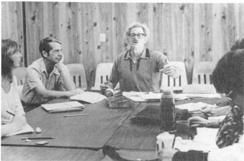
THE TEACHER. Norman Corwin conducts a class in creative writing at the Idyllwild School of Music and the Arts in California during the summer of 1983.