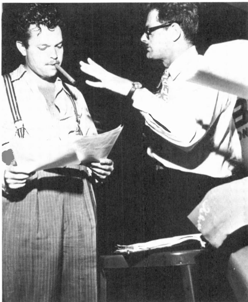
14 AUGUST. Orson Welles, after an all-night news vigil awaiting word of the Japanese surrender, listens as Corwin explains his special VJ program.