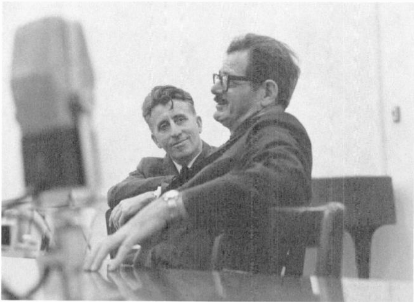
CORWIN OBSERVED. The author confers with Norman Corwin during a seminar visit to Indiana University.