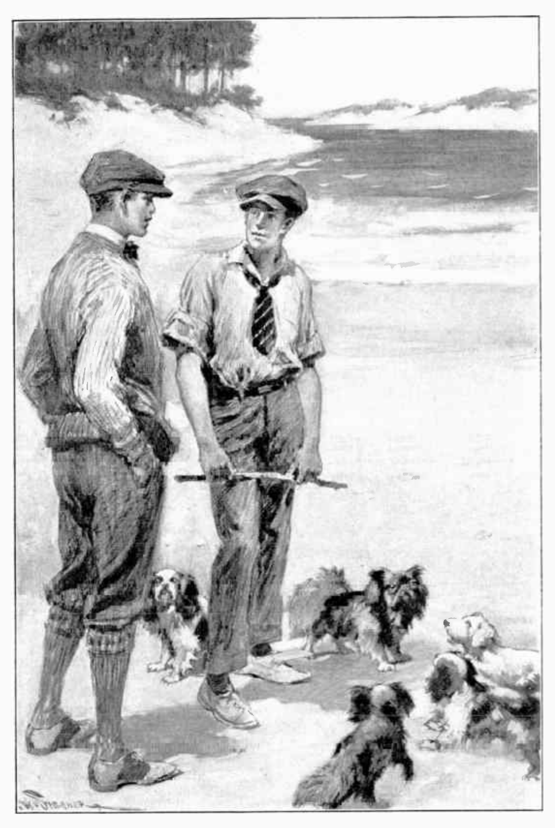
The two boys would discuss boats, fishing, and kindred interests. Page 76.