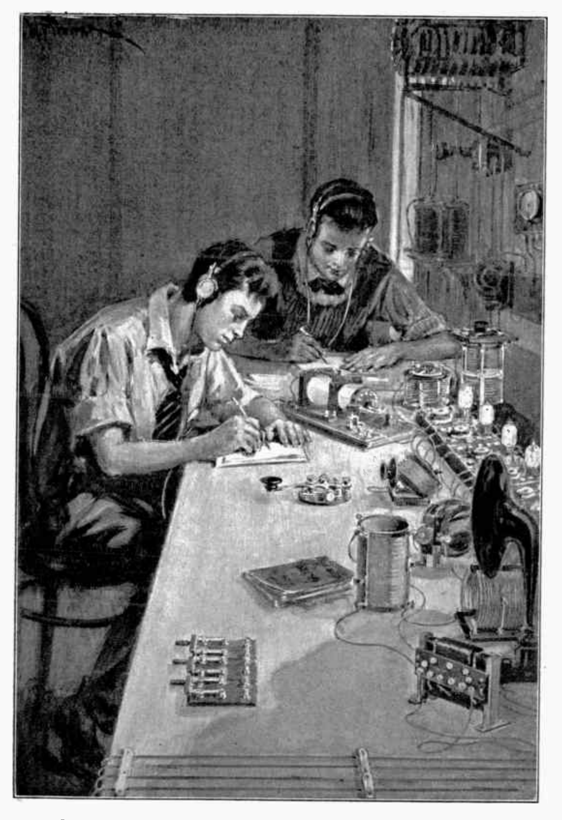
Clearly and evenly the message ticked itself off. Then there was silence. Page 240.