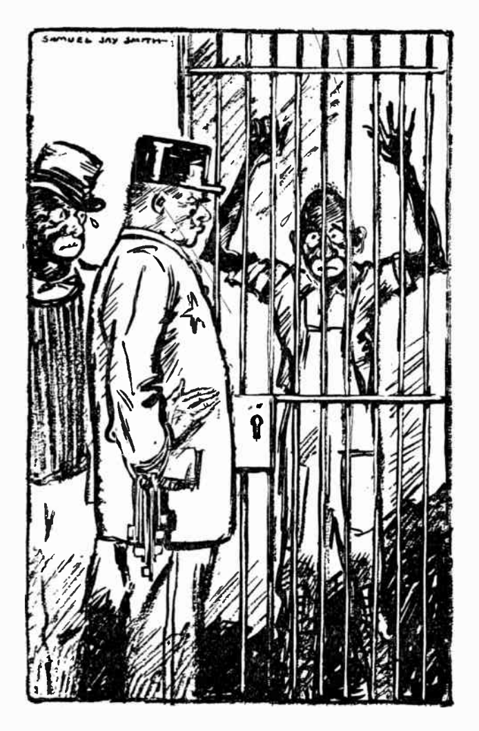
Sam. "Hey Mistah Jailah-Lemme out of heah."