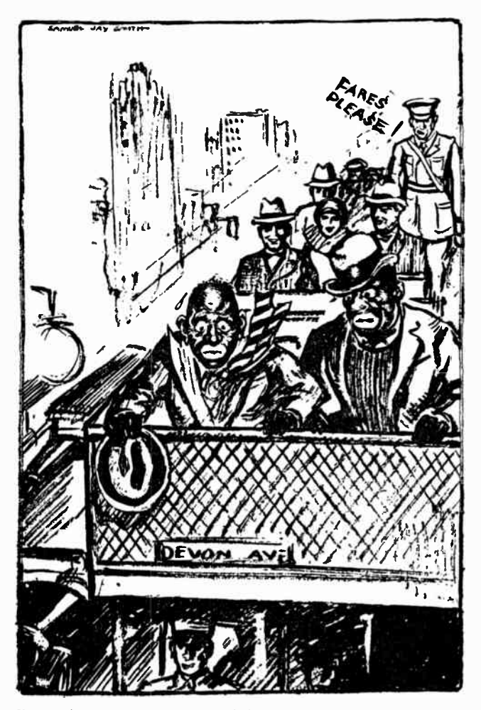
Sam—"Does you reckon dis heah thing's going to tu'n ovah?"