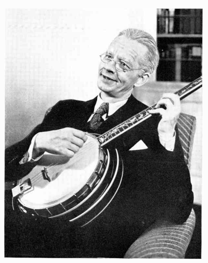
JUST PLAIN BILL WITH HIS BELOVED BANJO