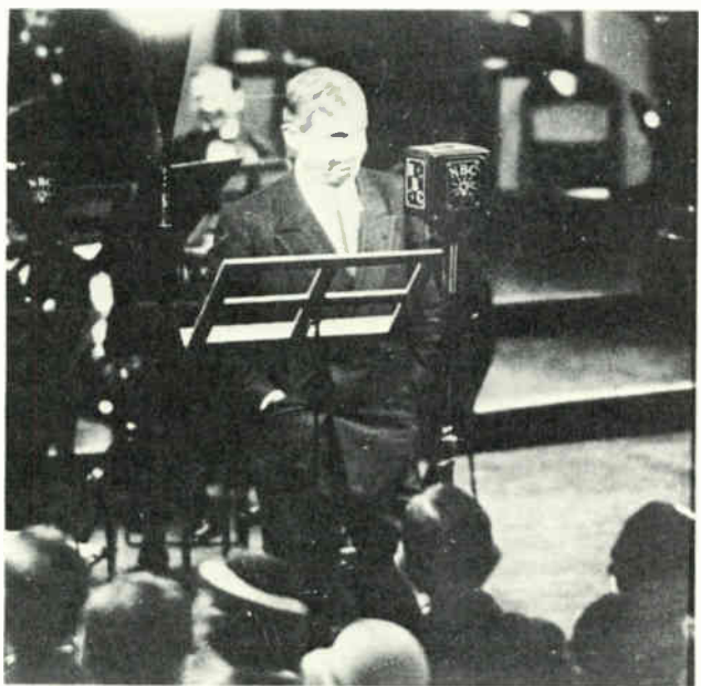
Will Rogers on the air probably for the Gulf Oil Company between 1933 and 1935. Note the bare lecture, clear evidence of the spontaneity of Rogers' broadcasts.