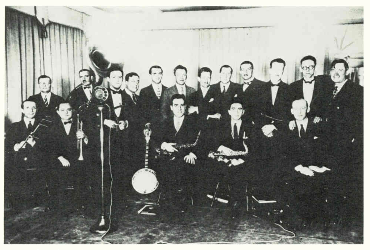
Will Rogers (far right) and members of the Eveready Orchestra at radio station WEAF in New York City on election night in 1924.