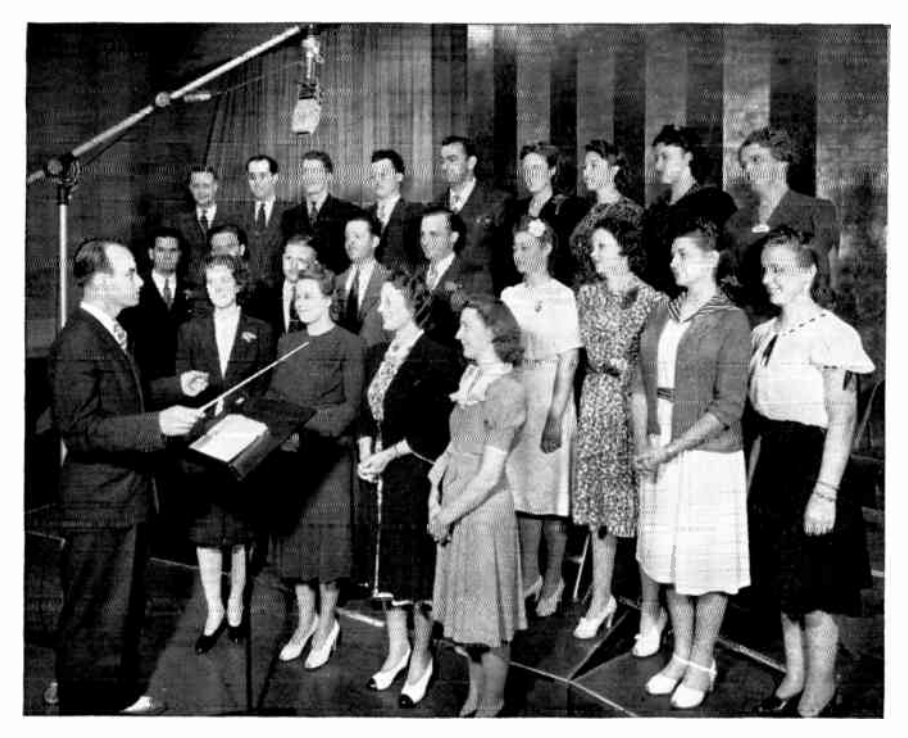
THE CHORUS CHOIR OF THE OLD FASHIONED REVIVAL HOUR