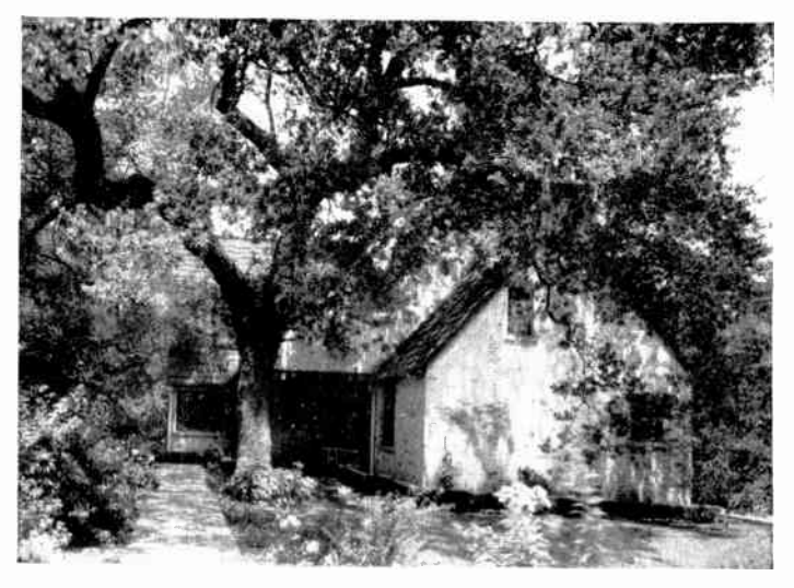
THE FULLER HOME IN SOUTH PASADENA