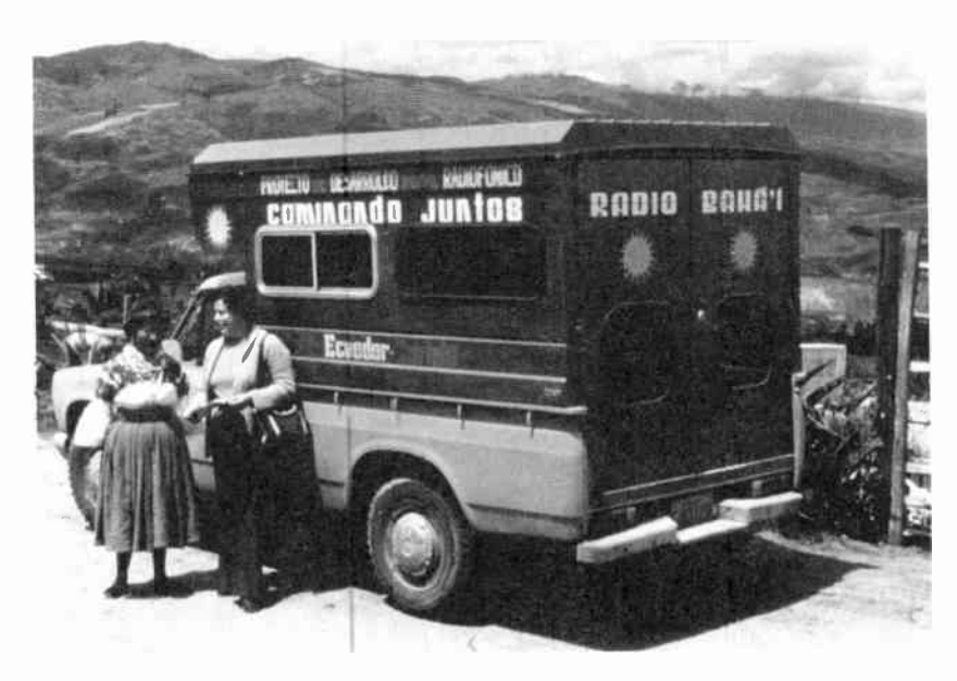
Radio Bahá'í's Rural Development Project Mobile Radio Van