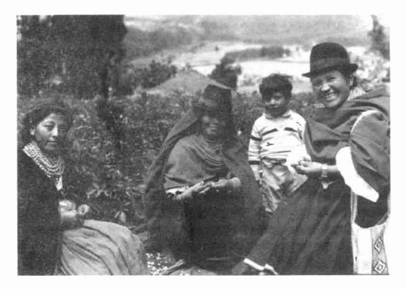
Women listen to Radio Bahá'í as they work in the fields. Radio Bahá'í's programs on child-care, nutrition, hygiene and health are designed to be of particular interest to women.