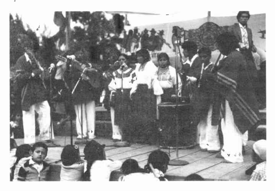
The annual festival of indigenous music, Nucanchic Tono, sponsored by Radio Bahá'í. The primary purpose of the festival is to help promote and preserve indigenous culture.