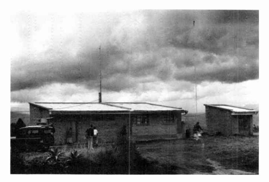
Radio Bahá'í AM transmitter at Cajas, Ecuador. The antenna mast is made from locally-available aluminum irrigation piping.