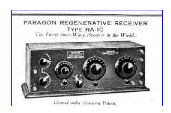
Figure 3 — An illustration of the Paragon RA-10 regenerative receiver from a 1922 Adams-Morgan catalogue immodestly promoted as "the finest short-wave receiver in the world." In 1922 the set sold for $75, which is equivalent to some $920 in today's currency. [Illustration courtesy of the Benson Ford Research Center, The