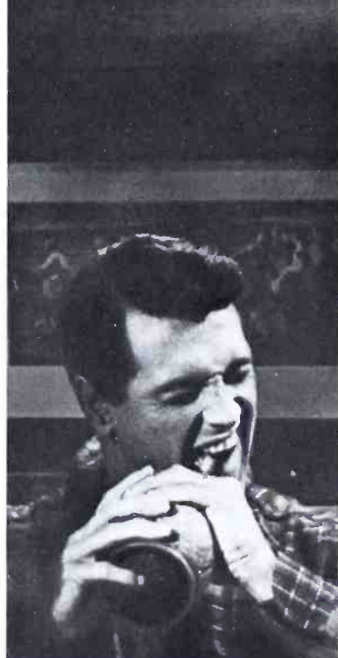
ALL THAT HEAVEN ALLOWS