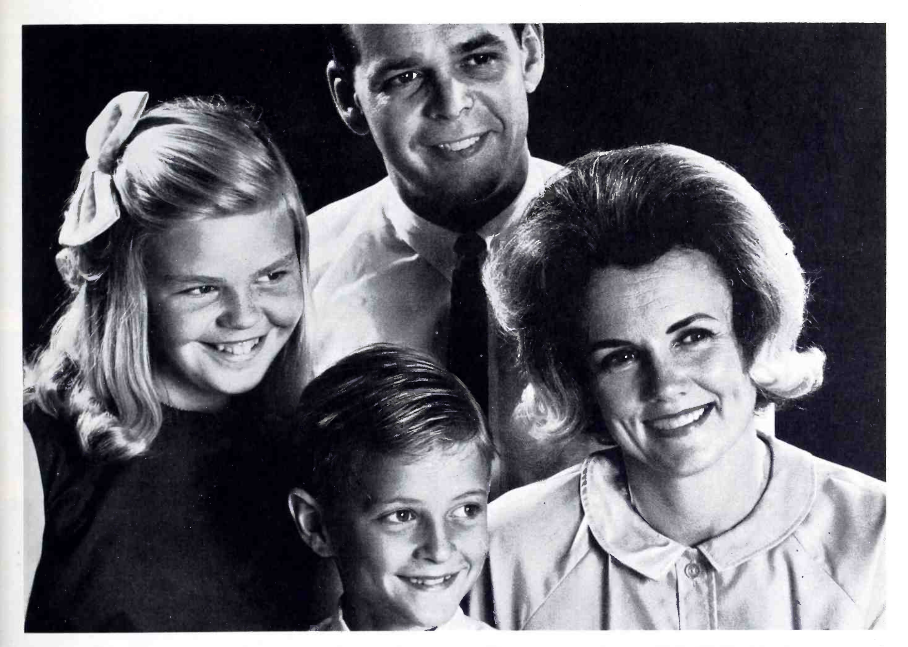
Sell Canada's largest radio audience-the CFRB listeners!

CFRB enjoys such a warm, personal relationship with its listeners. And, it gives you more listeners than any other radio station in Canada. 522,700 households—261,900 more than the next Toronto radio station. What better way to have your commercials well received throughout Toronto and nearby Southern Ontario communities? People expect more from CFRB in Toronto. Ever mindful of its responsibilities, "Ontario's Family Station" is always trying to do things just a little better, for both listeners and advertisers.