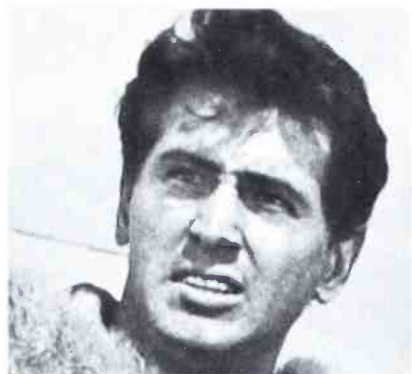
BACK TO GOD'S COUNTRY