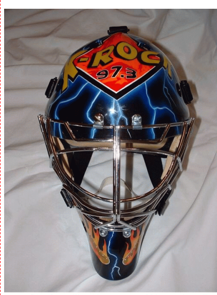
K-ROC Edmonton puts forth a marketing angle that only a Canadian station could get away with!

ADIO: As expected, CBC Radio has eliminated its national morning show, This Morning, from the program schedule. And CBC is also cutting half an hour from its local morning shows across the country. It's part of a major overhaul of its daily radio schedule. This Morning will be scrapped this summer... Portland, ORbased MeasureCast says Standard Broadcasting made an impressive debut appearance in its Internet radio rankings the week of April 22. Standard, which streams 11 stations, took the number nine spot in the Top 10 Internet Radio Networks chart... Some say that doing nothing is a reasonable option when confronted with a problem. The Canadian Broadcast Standards Council, however, is not among them. CBSC has cited CHIK-FM Quebec City for failing to respond to a complaint. The Standards Council says that violates the responsibility of CBSC Membership. The complainant had made known her exception to what she regarded as homophobic remarks made on CHIK and, accordingly, had sent the station a letter. The station didn't formally reply. Because of the elapsed time on this one, CHIK wasn't nicked for the sexual slur but was cited for not sticking with the protocol. Far more detail on this may be found at www.cbsc.ca... CKSY-95.1 FM and CKUE- 94.3 FM (THE ROCK) in