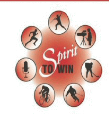
BCAB 57<sup>th</sup> Annual Conference May 12 - 14, 2004 Penticton, BC