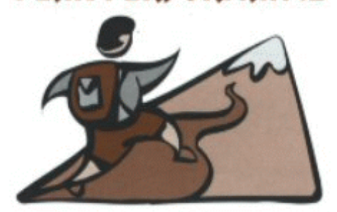
TURNING VISION INTO REALITY!

BCAB 58th Annual Conference May 11-13, 2005 Sun Peaks, BC