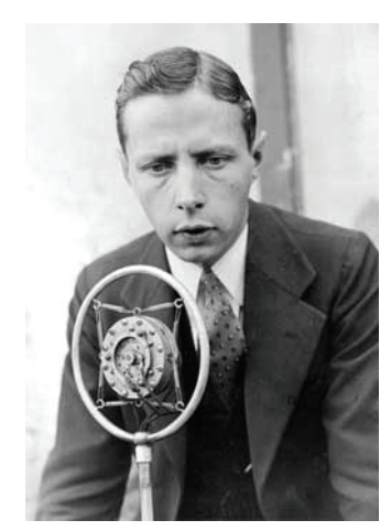
Foster Hewitt—the father of play by play broadcast hockey